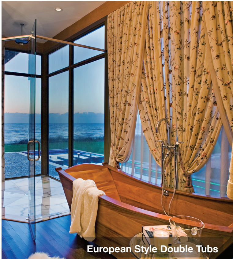
European Style Double Tubs