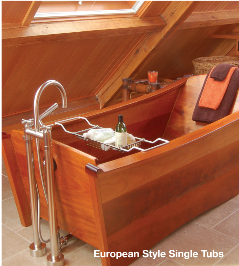
European Style Single Tubs