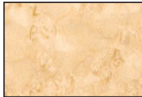
BIRDS EYE MAPLE